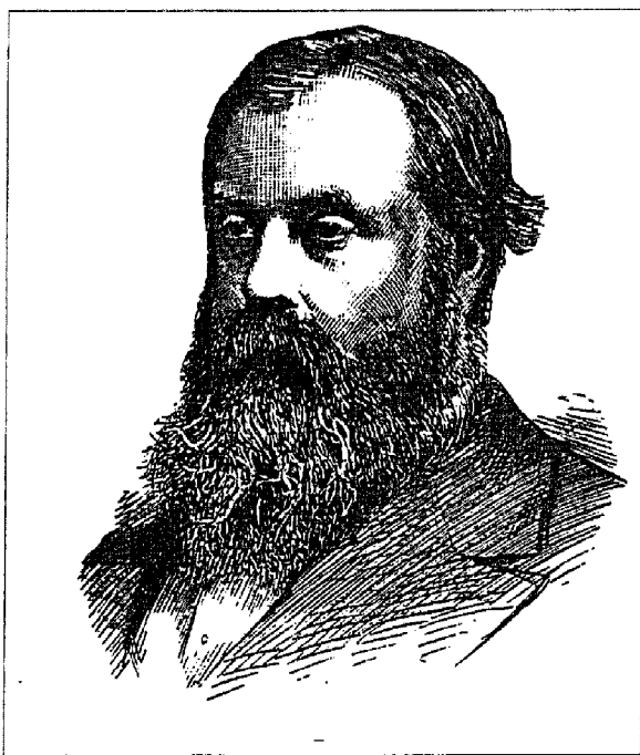
Frederick Guthrie

the time of these impression in 1885; but unlike Watson, Wells, while admitting that he had been an unruly and unprincipled student, was unforgiving. Guthrie's cancer had only "greatly enhanced the leaden atmosphere of his teaching.....Quite apart from that, he was not an inspiring teacher... to put it plainly, [Guthrie] mandered amidst ill-marshalled facts. He never said anything that was not to be found in a textbook (17)."